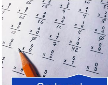
Goals and Assessment