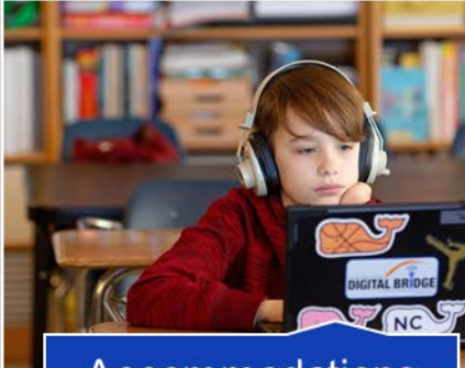
Accommodations and Modifications